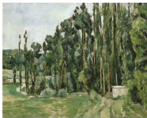
Paul Cézanne (1839-1906) Les Peupliers 1879-1880 Oil on canvas