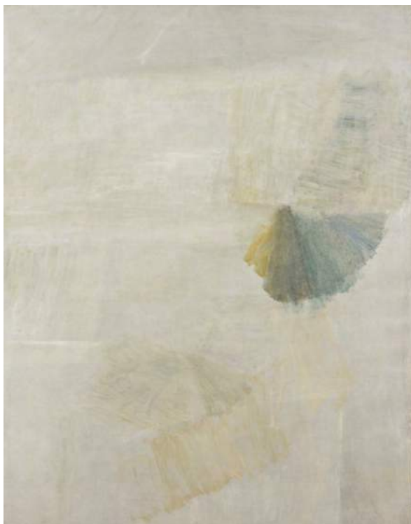
Geneviève Asse (née en 1923) Composition Couleurs dans l'espace [ Couleurs de l'espace ] 1966 Oil on canvas ■ Donation by the artist, 2011

The Fine Arts Museum of Lyon pays homage to the career of Geneviève Asse by highlighting a vast chronological range and the most significant moments of her work, as well as some lesser-known and studied subjects, including her early figurative period, works in white paint (rather than her trademark blue), and drawings.