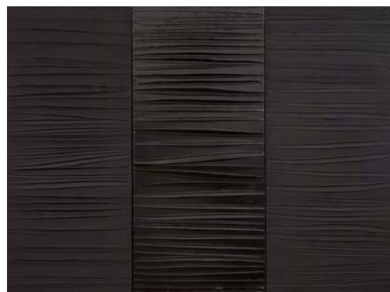
Pierre Soulages (born – 1919) Peinture 181 x 244 cm, 25 février 2009 Acrylic on canvas

Pierre Soulages (born – 1919) and Étienne-Martin (1913-1993) are now very well represented with, for the former, the entry of three works in 2012: Brou de noix sur papier 60,5 x 65,5 cm, 1947, Peinture 202 x 143 cm, 22 novembre 1967 and Peinture 181 x 244 cm, 25 février 2009 and for the latter, the acquisition in 2014 of Hommage à Brown (1988-1990), a sculpture that is supplemented by a series of donations by his family.