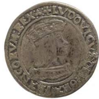
Louis XII, king of France Teston in struck silver, made in Lyon and dated 1514

The principal acquisition by the medallions is a teston of Louis XII that was struck in Lyon in 1514 and is the first French coin featuring a portrait of Louis XII. Moreover, the collections are regularly enriched by curious and precious pieces, although not all of them are from the cabinet of Michel Descours. The additions include delicate and lightweight Mesopotamian pieces in the form of a trussed up duck and a shell that was given to the museum in 2009.