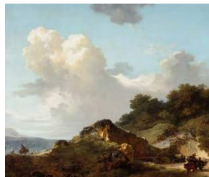
Jean-Honoré Fragonard (1732-1806) Le Rocher After 1780 Oil on canvas

■ Acquired with the aid of the Saint-Pierre Museum Club, 2013