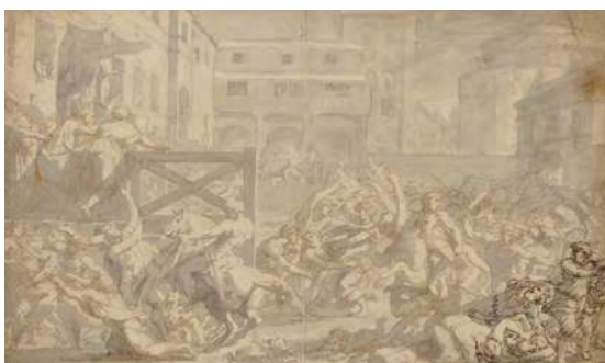
Jacques Stella (1596-1657) L'Enlèvement des Sabines Plume and brown ink applied with pierre noire, grey wash drawing, white gouache highlights, additional plume and brown ink