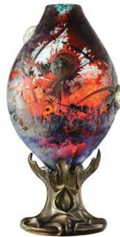
Émile Gallé (1846-1904) Vase Ca. 1904 Blown glass with bronze gilding ■ Acquired by the cabinet Bonnet – 2009