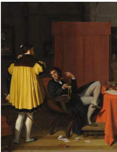
Jean Auguste Dominique Ingres (1780-1867) L'Arétin et l'envoyé de Charles Quint 1848