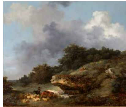
Jean-Honoré Fragonard (1732-1806) L'Abreuvoir Ca. 1765 Oil on canvas

The Department of Ancient Paintings has been enriched by the acquisition of several works, including Saint Augustin et son disciple Alypius recevant la visite de Ponticianus , a tempera on wood by Nicolo di Pietro (Ca. 1340-1414), which is a unique work in the French collections, a terracotta bust of Louis XV as a boy by Antoine Coysevox, and two paintings by Jacques Stella (1596-1657), one of which is Sémiramis appelée au combat (1637). The arrival of two landscapes by Jean-Honoré Fragonard (1732-1806) thanks to the Saint-Pierre Museum Club – L'Abreuvoir (Ca. 1765) and Le Rocher (after 1780) - complete the collection in spectacular fashion.