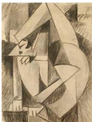
Albert Gleizes (1881-1953) Clown 1914 Charcoal on paper

■ A gift from the Friends of the Museum association in 2012